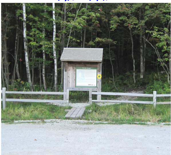
Here's the Mystery Photo for this issue. Do you know where this kiosk and trail head is? We run by it in this summertime trail race. Hint: it's next to an old "Indian road." Any guesses?