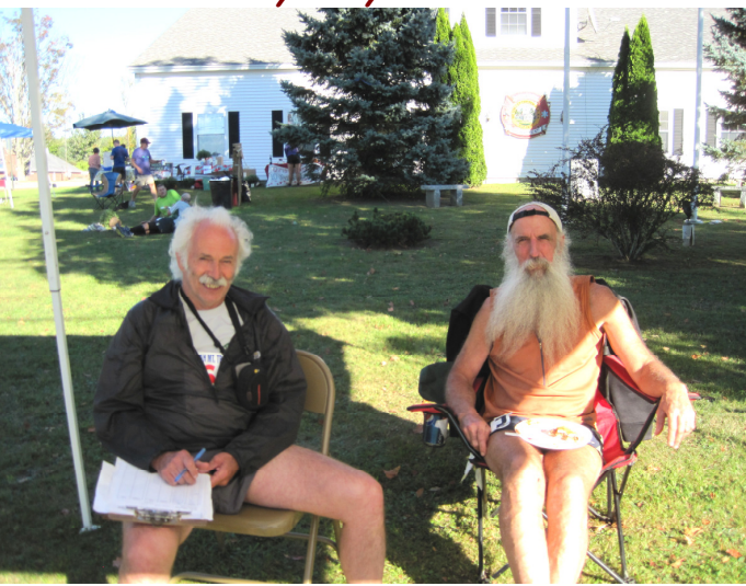
This was the mystery photo in the last newsletter. Did you know who these "Old Time" trail runners are?