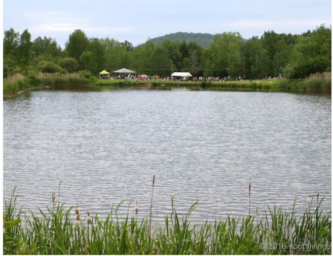
We had 2 runners from Britain join us this year so for them here is a view of the finish area at Greylock "from across the pond."