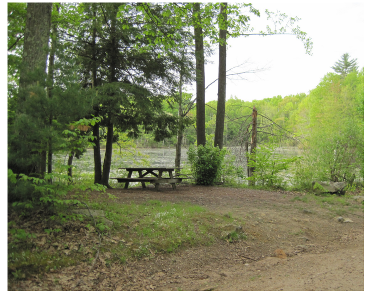
Here's the mystery photo for this issue.

In which trail race do we run by this picnic table and pond?