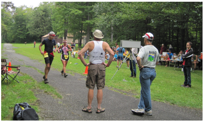
Runners crossing the finish line at the Savoy MT. races.