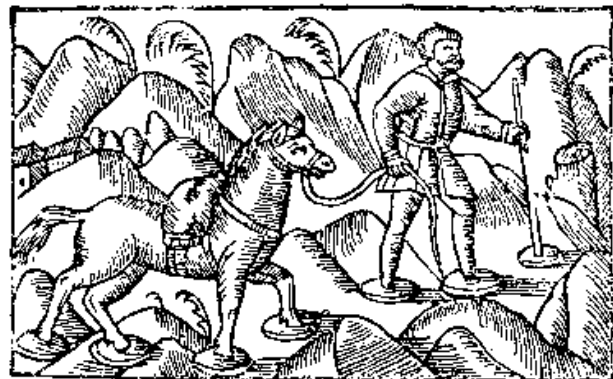
This work is in the public domain in the United States because it was published before January 1, 1923