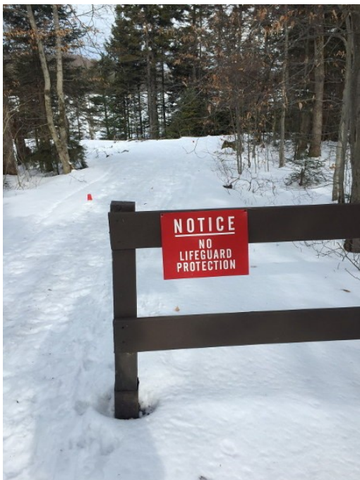
a tad ominous.....