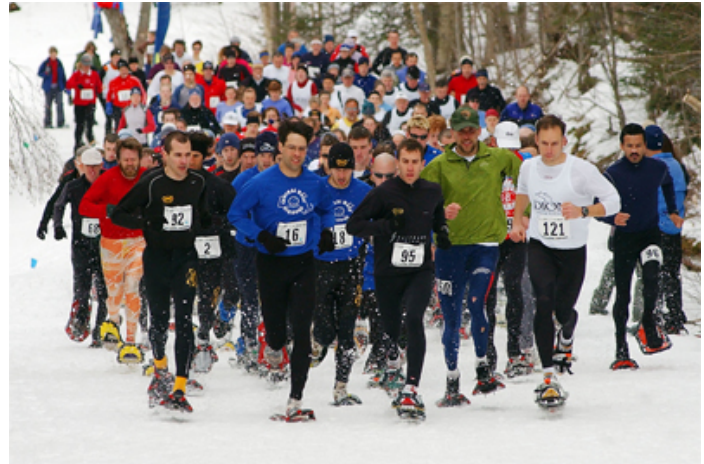
Start of the 10Km Event, courtesy of the U.S.S.S.A. -- http://www.snowshoeracing.com/