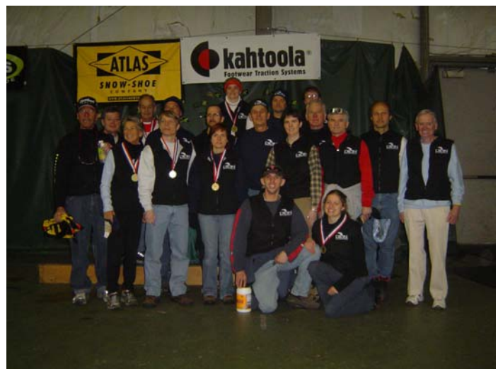
A good chunk of the Northeast Gang after Nationals