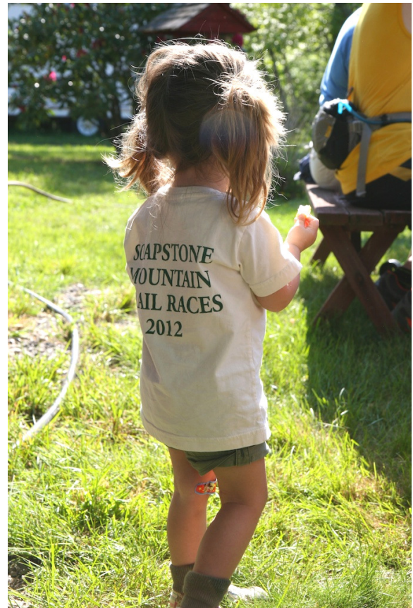
Dahlia Livingston advertising this year's race.