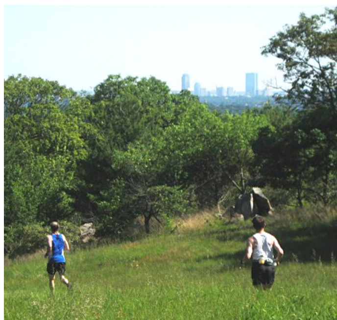
A sunny day at Skyline!