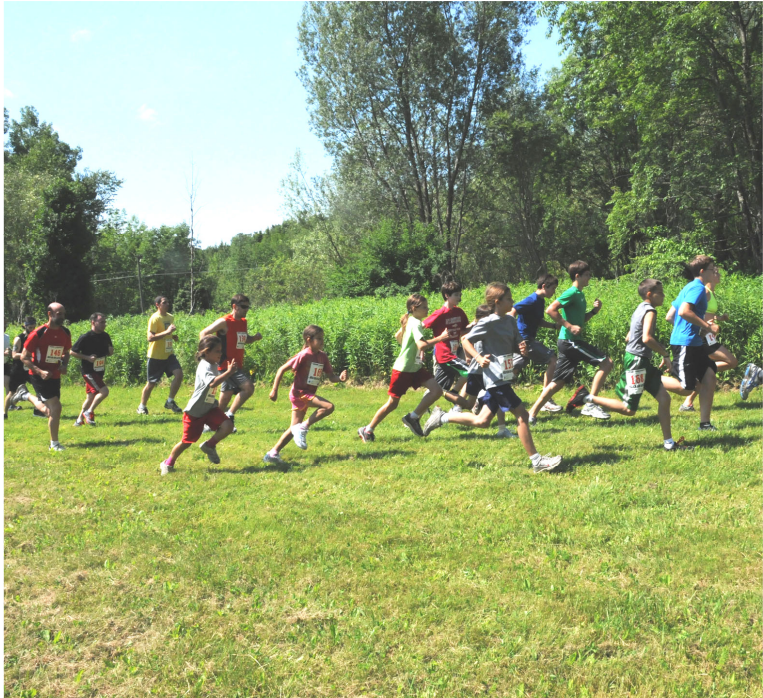
5K racers head into the woods some 10 minutes after the long race start.