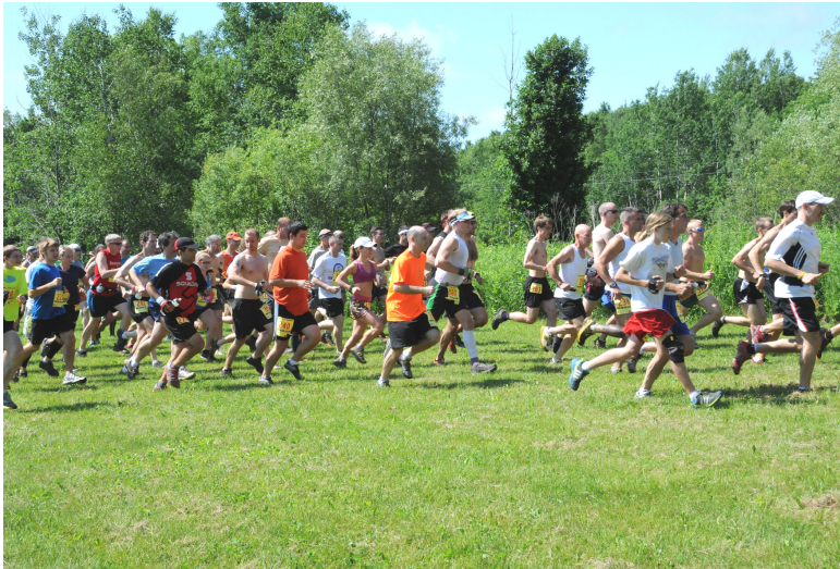
Off n' running at the long race start