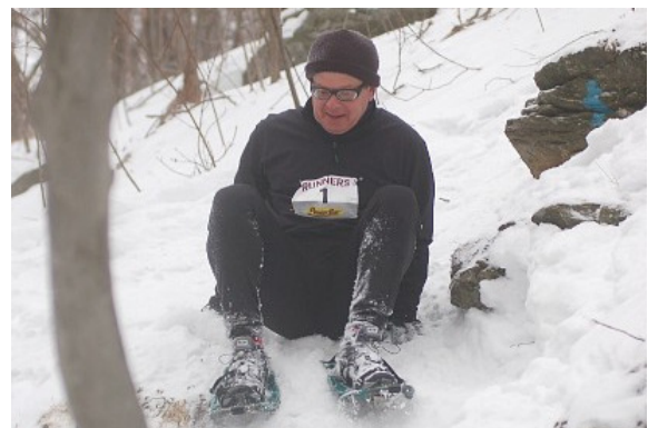
K2 sliding down the hill